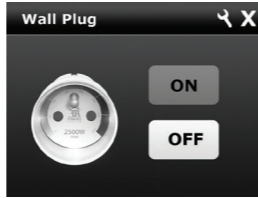
Fig. 1 Wall Plug icon in Home Center 2 interface

After successful inclusion Plug will be represented in the Home Center 2 by the following, single icon: